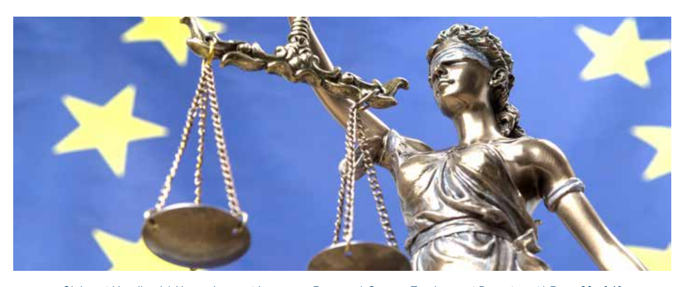
Claimant Handbook | Unemployment Insurance Program | Oregon Employment Department | Page 29 of 40