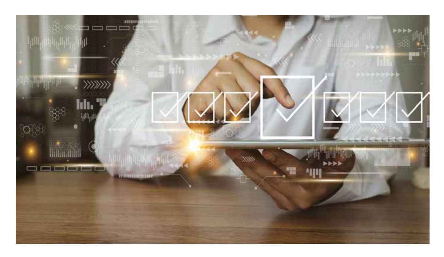
Claimant Handbook | Unemployment Insurance Program | Oregon Employment Department | Page 9 of 40